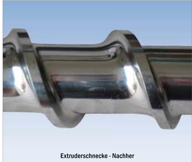
Extruderschnecke - Nachher