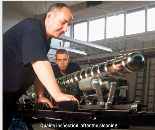
Quality inspection after the cleaning

In addition to a comprehensive consultation, we offer you the opportunity to carry out their own cleaning tests of tools up to a length of 3 m and / or weight of 4 tons.