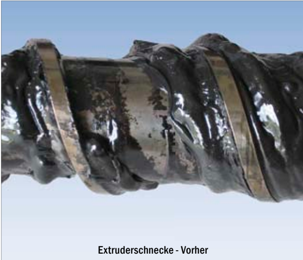
Extruderschnecke - Vorher